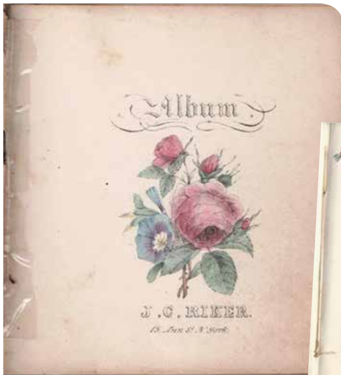
Pam Beveridge's orphan heirloom rescues include autograph books (left and bottom), as well as personal correspondence (below).